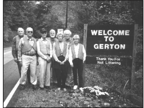
The first Adopt-A-Highway group in N.C. - Upper Hickory Nut Gorge Community in Henderson County

Since its inception, thousands of AAH volunteers have worked to keep N.C. roadsides clean. This is accomplished by removing and recycling litter from roadsides and educating the public about the importance of proper trash disposal. The AAH groups have adopted more than 10,000 miles of N.C. roadsides.